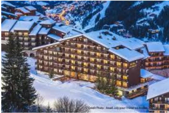
Hotel Arolles, Ski In-Ski Out

In the 3-Valleys France, Largest in the World 166 Ski Lifts, 375 Miles of Groomed Runs