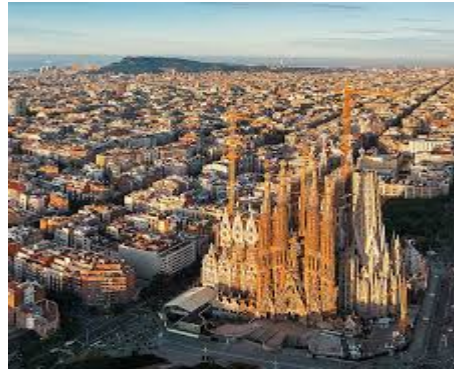
Cathedral Sagrada Familia Barcelona

In the 3-Valleys France, Largest in the World 166 Ski Lifts, 375 Miles of Groomed Runs